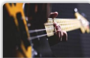
Music Appreciation 2