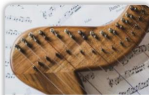
Music Appreciation 1