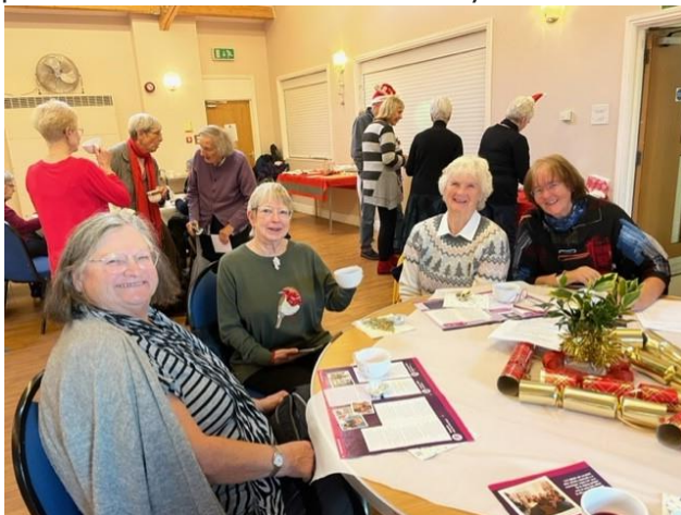
Some photos from the Christmas Party: